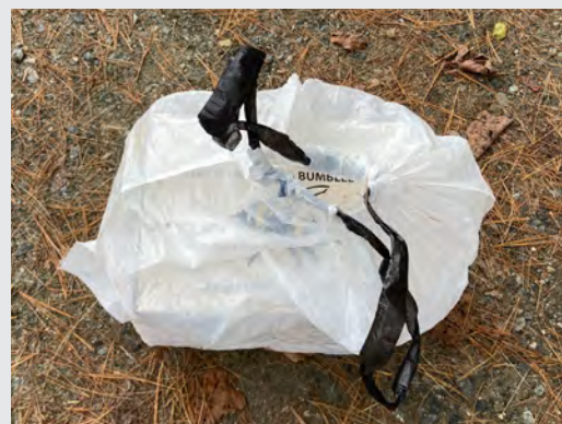
Exhausted commercial colonies are recommended to be dispatched humanely, with bee boxes sealed in a garbage bag for disposal.