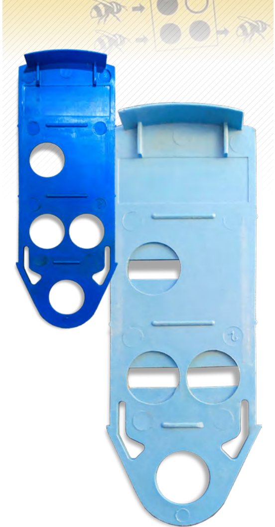
An example of a queen excluding door (light blue). Note reduce sized openings compared to a non-excluding insert (dark blue, inset). Not to scale.